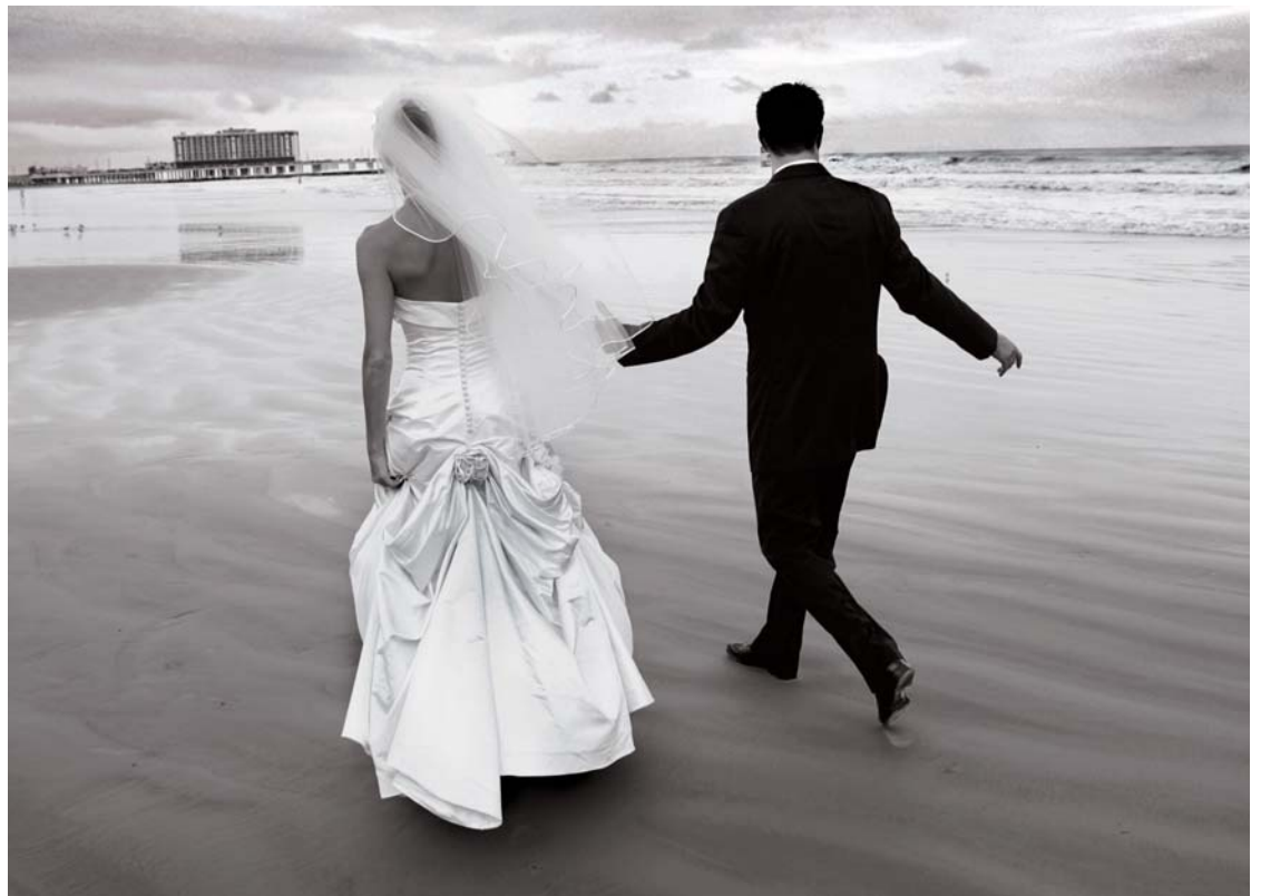
A mix of formal and candid shots in both black-and-white and color will leave you with a perfectly balanced album.